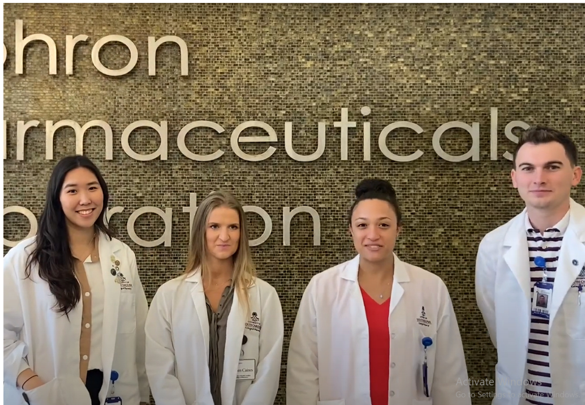
"Challenge Accepted" 🧑‍🎓 | A student research team from the UofSC College of Pharmacy won first place in a recent SCBIO Student Video competition. Read more