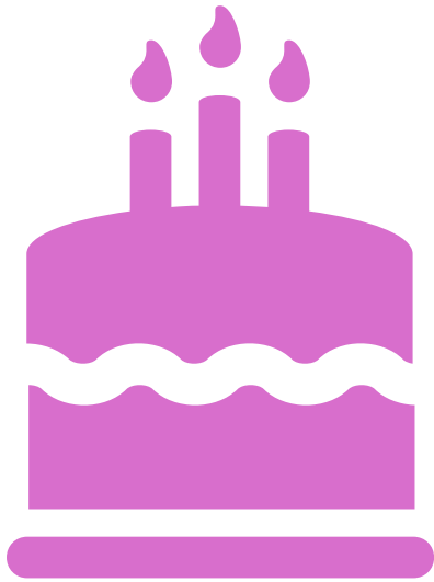
Figure B.1 Image of a birthday cake

Notes: Lorem ipsum dolor sit amet, consectetur adipiscing elit. Maecenas porttitor congue massa. Fusce posuere, magna sed pulvinar ultricies, purus lectus malesuada libero, sit amet commodo magna eros quis urna.