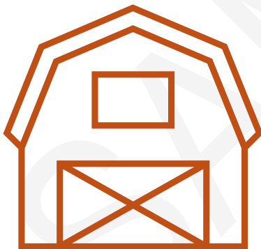
Figure B.2 Image of a barn

Notes: Lorem ipsum dolor sit amet, consectetur adipiscing elit. Maecenas porttitor congue massa. Fusce posuere, magna sed pulvinar ultricies, purus lectus malesuada libero, sit amet commodo magna eros quis urna.