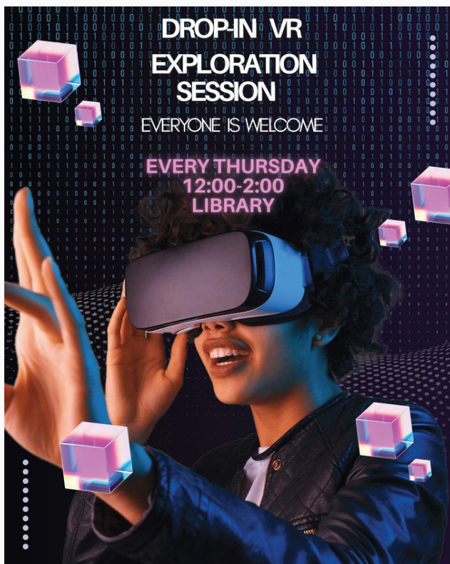
A flyer advertising VR library sessions.

We're inviting individuals to explore the Counseling and Rehabilitation VR Lab for free! Schedule a visit using this link , and our trained Graduate Assistants will guide you through various VR experiences based on your goals. It's the perfect opportunity to discover how these technologies can help improve mental health and support physical recovery.