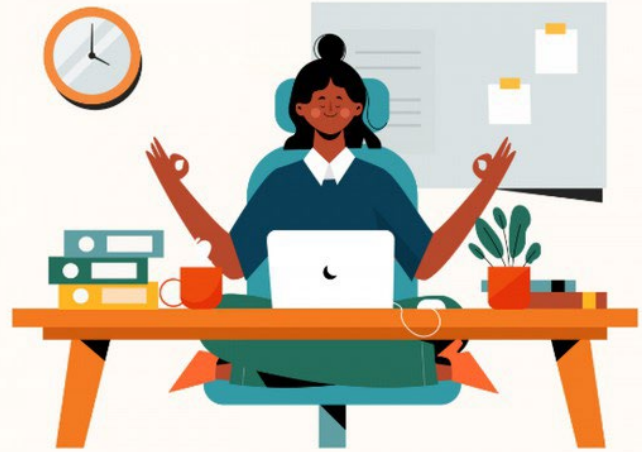
A cartoon graphic to represent self-care during work hours.

As the school year begins, it’s important to prioritize your well-being alongside your academic responsibilities. Building in small acts of self-care—such as setting realistic schedules, taking breaks, and staying connected with supportive peers—can help reduce stress and prevent burnout. Remember, taking care of yourself is not a luxury; it’s essential for your success both in and out of the classroom.