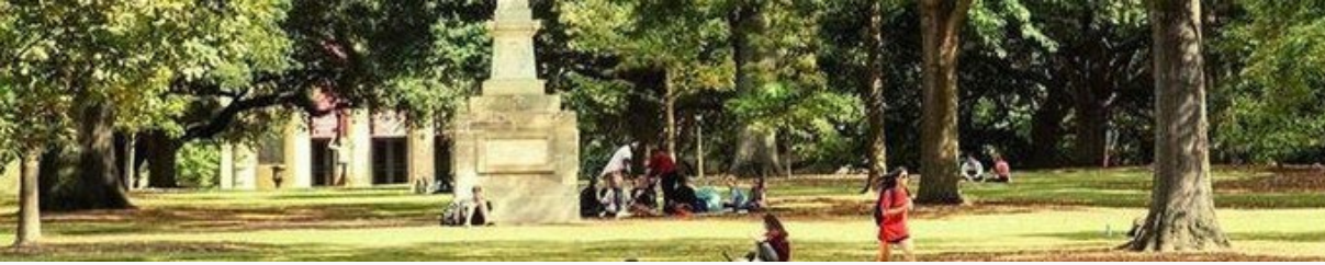
(students walking across a field of green grass with trees and a stone statue standing in the middle of the field)