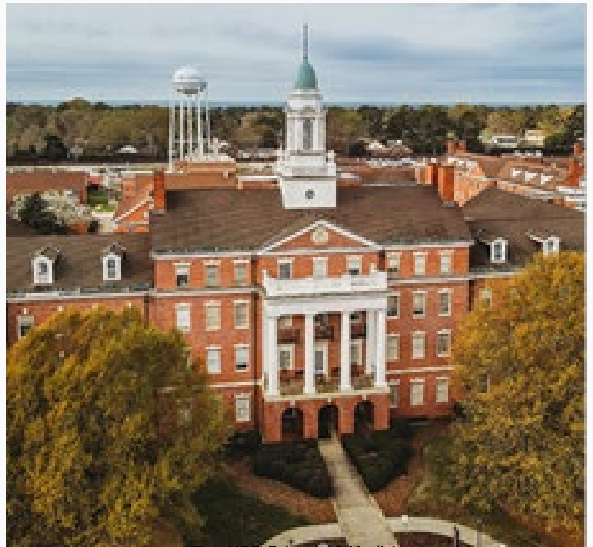
The USC School of Medicine.

The Counseling and Rehabilitation Program hosted the first of two Advisory Board meetings for the 2025 – 2026 academic year on January 9th. The Counseling and Rehabilitation Program’s Advisory Board is comprised of representatives from agencies and programs across the state who gather two times per year to share updates, perspectives, and notable trends in their area of focus within the counseling field with an ultimate goal of positively impacting the Counseling and Rehabilitation Program and future counselors who will serve our SC communities.