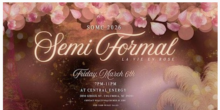
Semi-Formal Advertisement Flyer.

Get ready for the 4th Annual School of Medicine Semi-Formal! We can’t wait to celebrate another amazing year with all of you! This time, we’re bringing a touch of Parisian magic to the night with our theme: “La Vie en Rose.” Think pink hues, romantic vibes, and a little French flair — but don’t stress about sticking to the theme! Dress in whatever makes you feel fabulous.