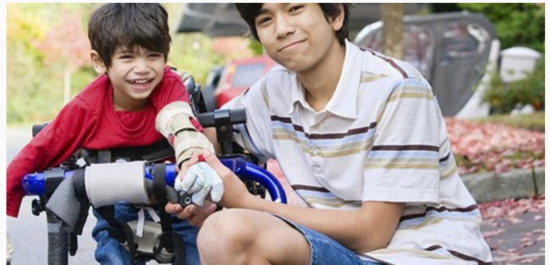
Two children utilizing assistive technology.